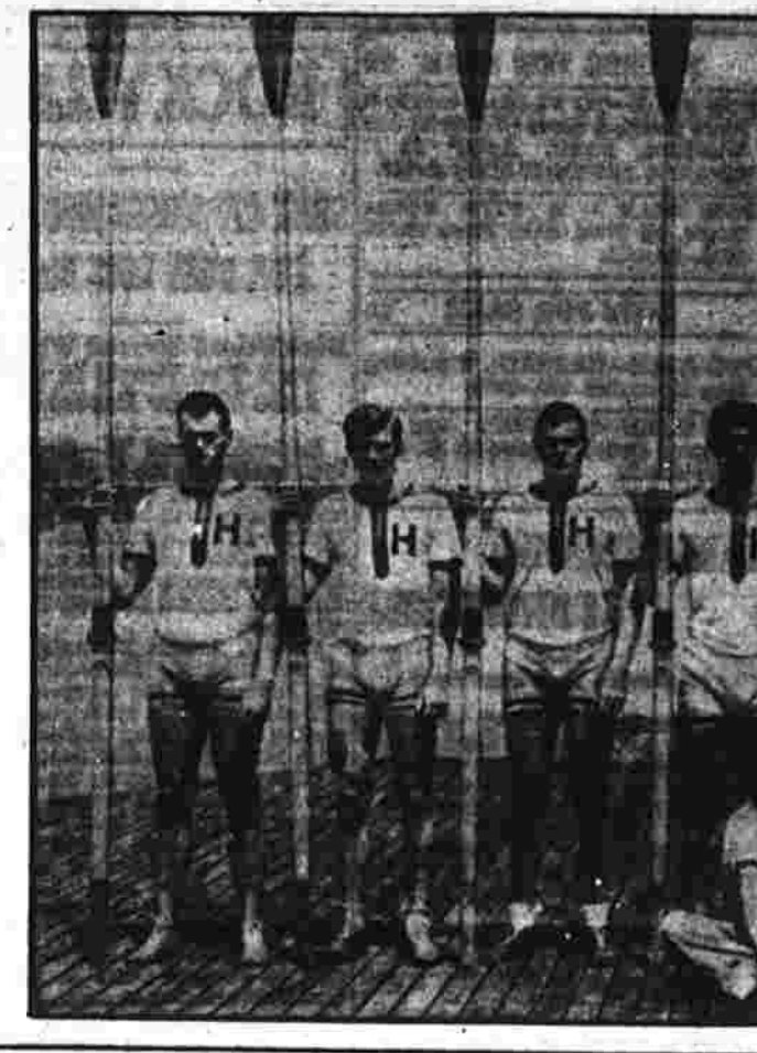
Harvard's great crew, victorious over Yale yesterday, set a new record for the 20-mile race on the Thames. The crew, consisting of eight rowers and a coxswain, completed the race in 1 hour, 11 minutes and 45 seconds. The Yale crew finished second in 1 hour, 14 minutes and 30 seconds.

Harvard's Great Crew, Victorious Over Yale Yesterday